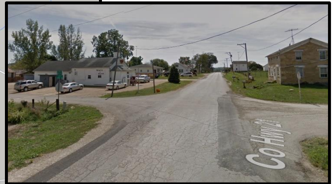
"Slurp n' Burp," 4319 S. Loran Rd Village of Loran, IL

Directions: The Loran Property is located on Beyer Road west of Pearl City, IL in Stephenson County.