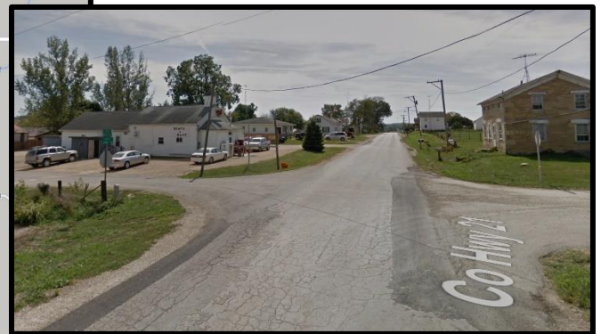
"Slurp n' Burp," 4319 S. Loran Rd Village of Loran, IL

Directions: The Loran Property is located on Beyer Road west of Pearl City, IL in Stephenson County.